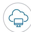
MANAGED CATALOG & RENEWALS

Underpinned by a comprehensive service governance model, this is achieved through streamlined procurement processes, visibility into all software transactions, improved end-user experience, and more proactive contract renewal management.